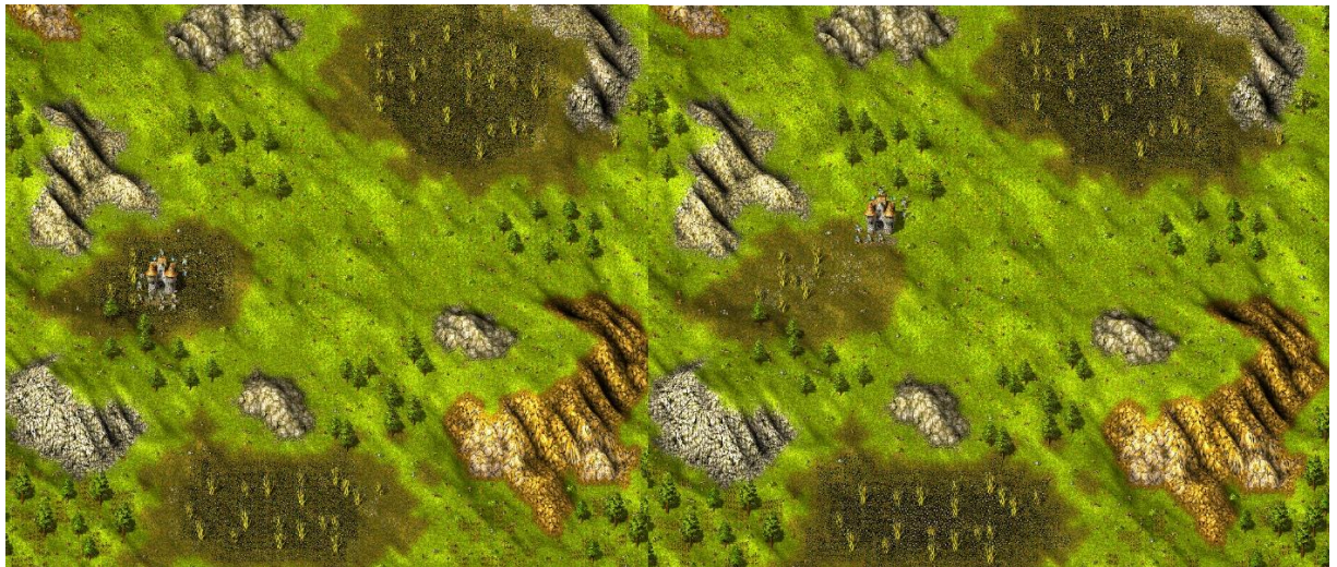
Example of different coal generation at same location

Players do not know the map where they will play. Map is generated at start of the game based on creation templates. There are 290 different locations templates. Each location might have different amount of mines, coal, fish and wine fields. Placement of resources, amount and possibilities to make mines are different each time you play any location.